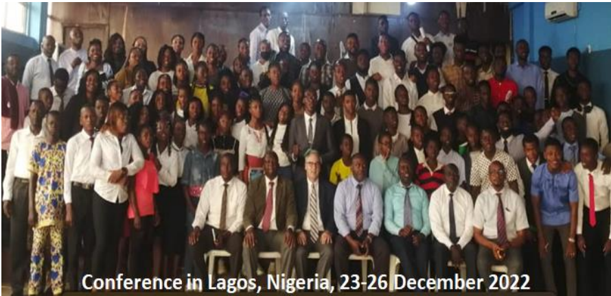
Conference in Lagos, Nigeria, 23-26 December 2022

After a break of three years due to the pandemic, praise the Lord for restoring our physical conference in December 2022! It was a precious time of blending and reunion for the saints. The general subject was "Loving the Lord and Loving One Another for the Organic Building Up of the Church as the Body of Christ". 338 saints from various localities in Nigeria and 18 saints from the Benin Republic participated in the conference.