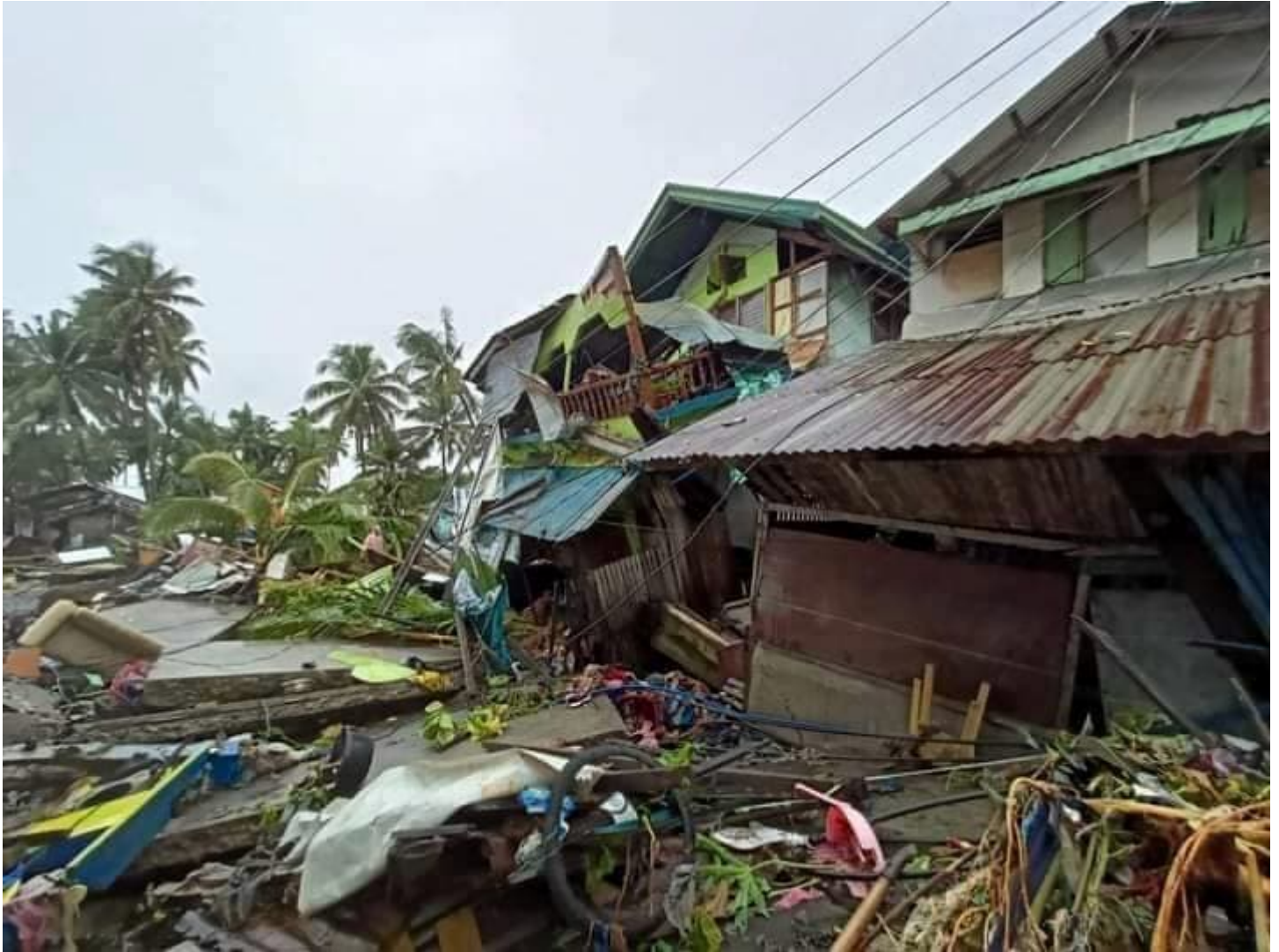
Within this area are damaged houses of the saints located.