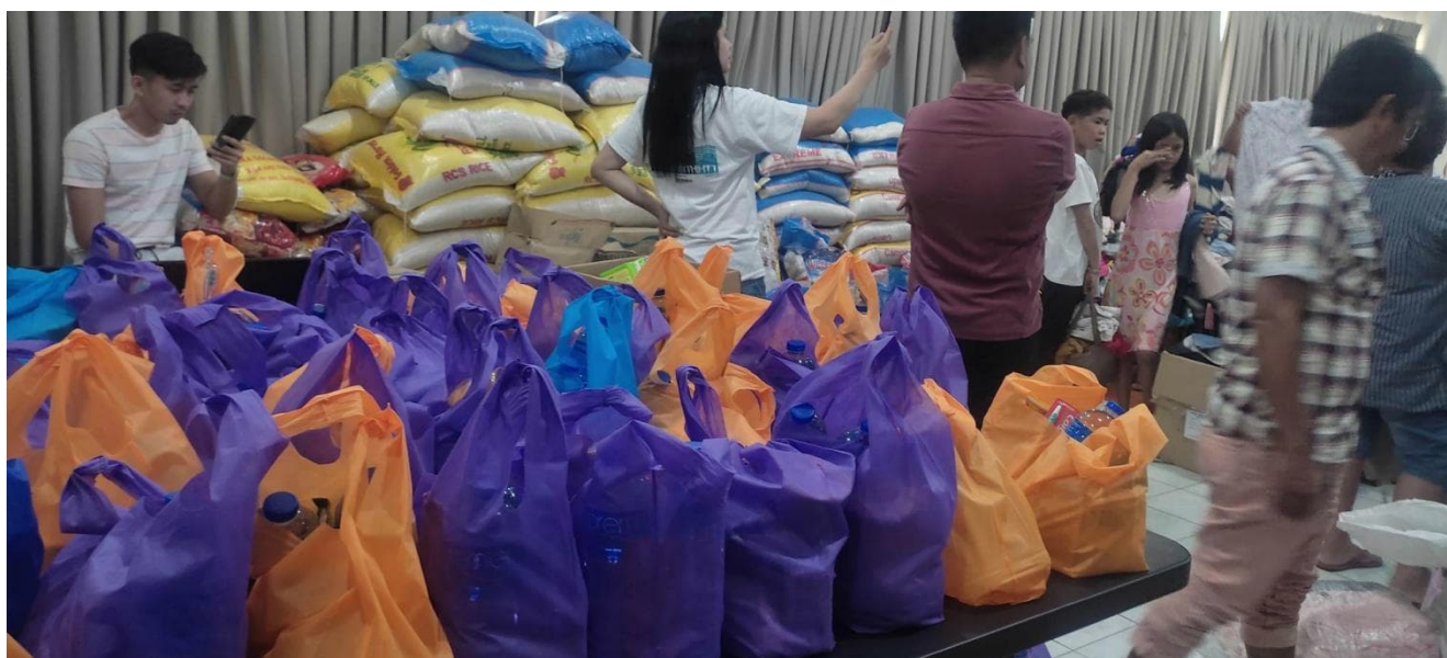
The serving saints preparing distribution of the relief goods for the affected saints of the calamity.