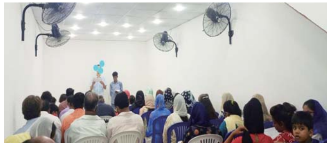
New meeting hall of the church in Karachi

The number of saints in the church life is 34. Despite the fact that many of the saints came from Christian background, they are unfamiliar with the Bible. Many lack a basic foundation of the truth even though they've been practicing daily morning revival, attending weekly meetings prophesying on Lord's Day since coming into the church life. A year ago we began to examine how we might lay a good foundation of the truth for the word of the Lord to dwell in us richly. We began by reading through Book of Genesis in two weeks, going through five chapters a day. Before we started reading, we each wrote down a summary point for each of the fifty chapters of Genesis based on the outline of the Recovery Version and on our understanding of the word. After reading five chapters each day, we would take a few minutes to review what we read and the five summary points of the five chapters. We would then repeat these points again and again during the day and speak it to one another. Through constant repetition, the fifty points of Genesis were