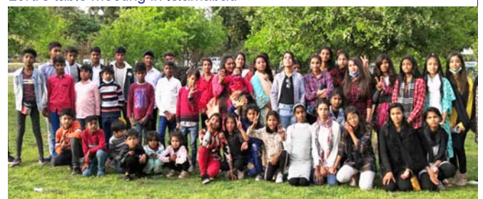
Young people's meeting in Islamabad