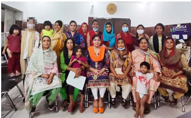
Sisters' meeting in Lahore

In addition, in order to help the saints understand the truth and take the way of being constituted with the truth, we set up a plan for truth pursuit: a daily reading of the life-studies as well as three chapters of the Old Testament and one chapter of the New Testament. After three months of practice, we finished reading all the Life-study messages of Matthew and some Life-study messages of Genesis. At present, ten saints are still following this reading schedule.