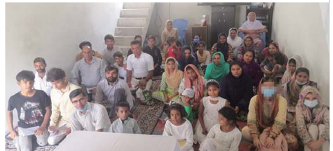
Lord's table meeting in Islamabad

With the resumption of physical meetings, we also resumed the preaching of the gospel through door-knocking. About 40 brothers and sisters participate in the weekly gospel move. Furthermore, recently the church has been blessed by the Lord in the matter of shepherding. Some brothers have been praying for the weak, backslidden, and dormant saints in the church life. Although these brothers are busy at work, they still give priority to the shepherding of the brothers and sisters. Through their visitation, shepherding and having love feasts with these ones after work, many backslidden ones were restored. In June and July, the average attendance on Lord's day was at about 100; in August, that number rose to 108, and in September, reached 120. Thank the Lord! The Lord has truly poured out His blessing on the church through the one accord of the brothers!