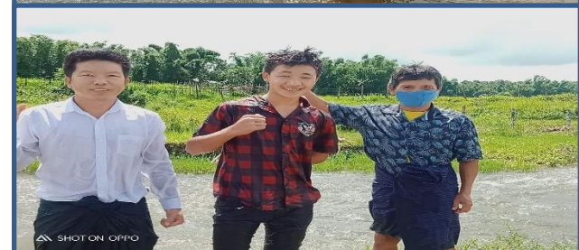
Baptism of brother from the Church in