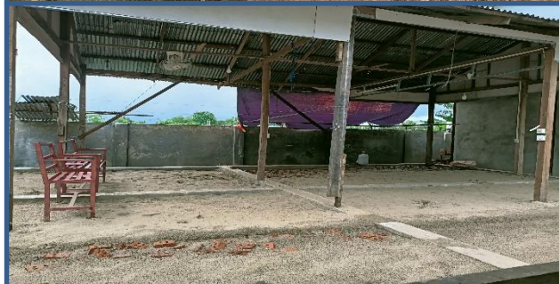
Extension building of Sister's dormitory