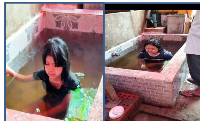
Baptism of sisters from the Church in Yangon Meeting Hall 6