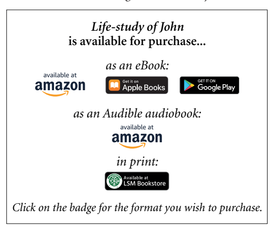
This booklet is compiled from Life-study of John . © 1984 Living Stream Ministry

Quite often I have received letters from individuals or from churches who are crying for help, saying, "Brother, we are so weak. Please come to help us." Whenever I have received such a letter, I said, "You are weak, but you are not yet dead. Even if you are dead, you have not yet begun to smell." We need to wait until the death situation comes to the surface; then the Lord Jesus will come in to change death into life. Everything that the Lord does is according to this principle of changing death into life.