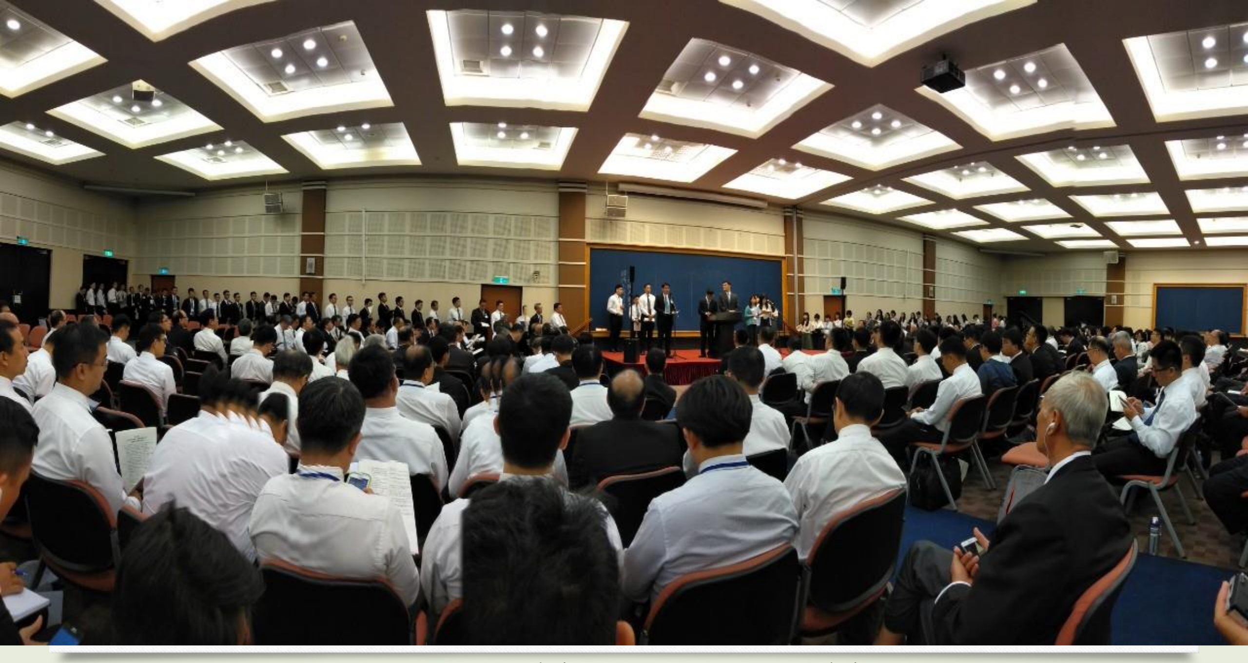
BLENDING AND TRAINING IN TAIWAN